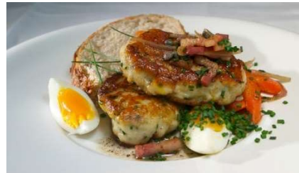
Fish cakes from minced Haddock

The lean meat of Haddock holds together well which makes it particularly suitable for minced fish dishes.