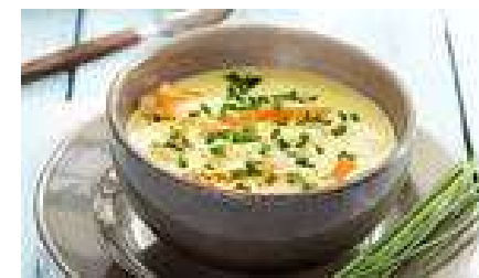
Fish soup with Haddock.