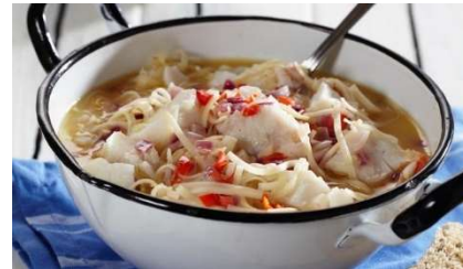
Fish stew from haddock with noodles.