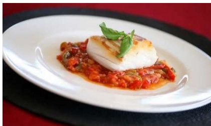
Fried Haddock with vegetable stew.